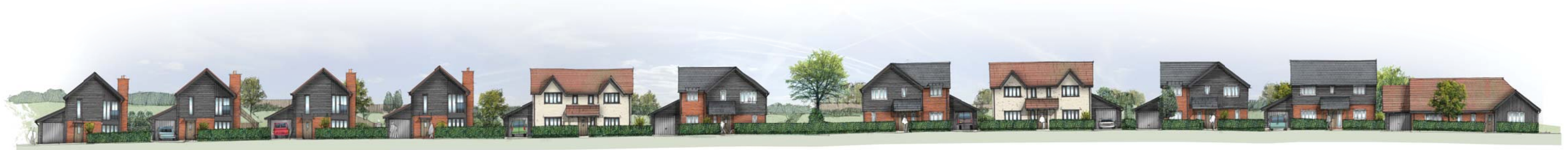
A - A'