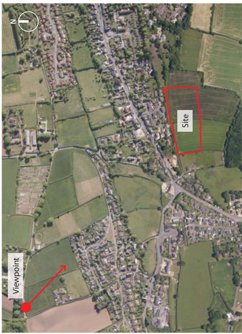
View from field gate adjacent to the East Devon Way

The establishment of a maximum ridgeline height of 55.5m (AOD) for the Outline Planning Scheme has been maintained during the development of the Reserved Matters Scheme. This ensures that the development is restricted to the lower slopes of the site to avoid breaking the skyline and to mitigate any potential landscape impacts.