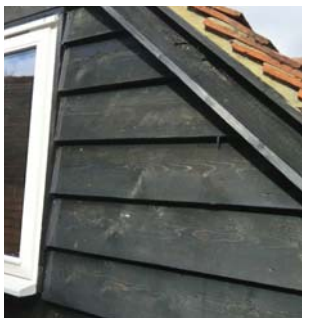
Black Timber Cladding