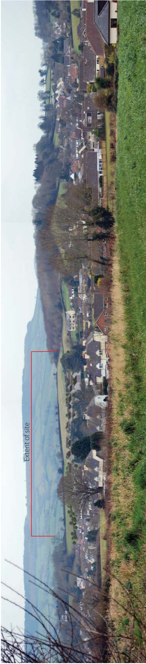
View from field gate adjacent to the East Devon Way - Reserved Matters Scheme