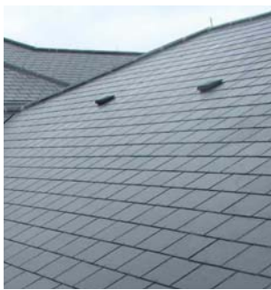
Slate Tile Roofing