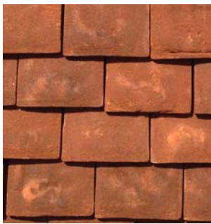
Clay Coloured Tile Hanging