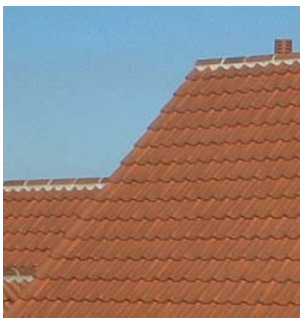
Clay Coloured Tile Roofing