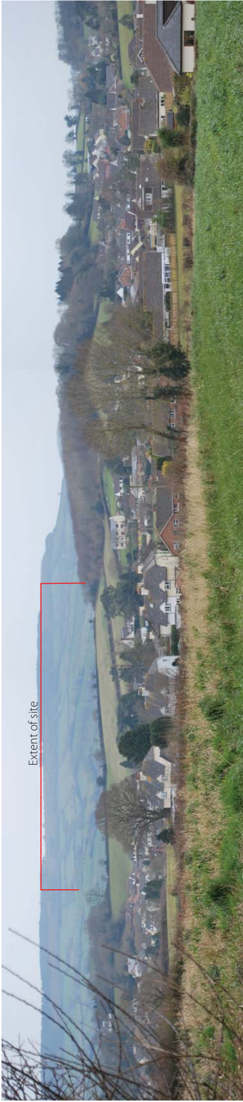
View from field gate adjacent to the East Devon Way - Existing

Land at King Alfred Way, Newton Poppleford