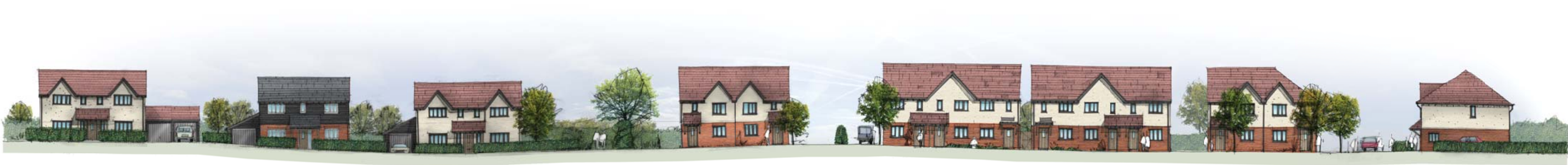
C - C'