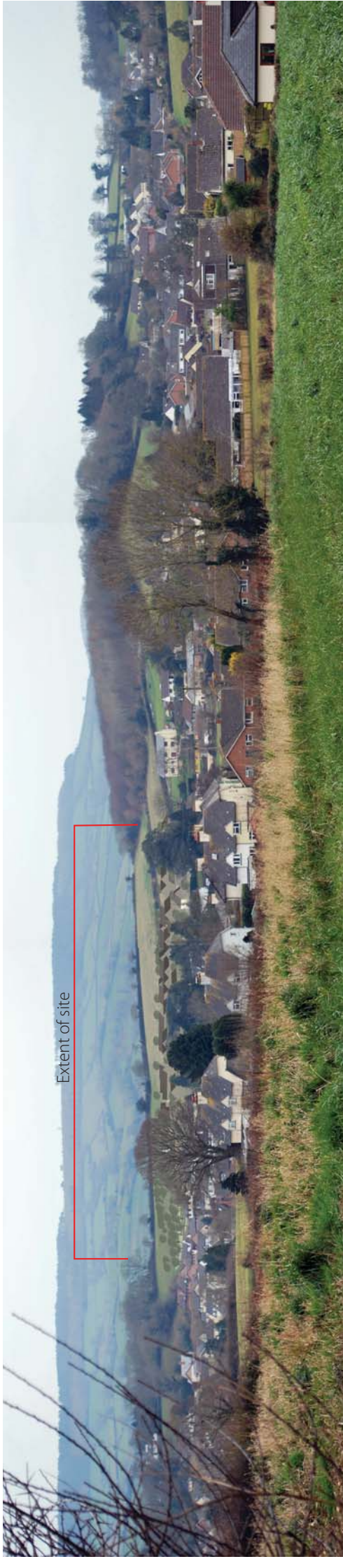
View from field gate adjacent to the East Devon Way - Outline Planning Scheme