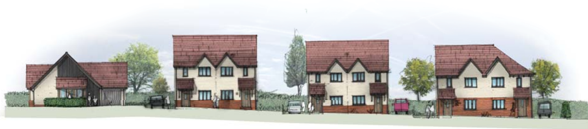
D - D'

Mainly detached houses with either brick or render finishes and black timber-clad upper floors. Black timber clad lean-to garages. Gable roof dormers and gable roof projections. Bargeboards and exposed rafters stained black. Feature canopies.