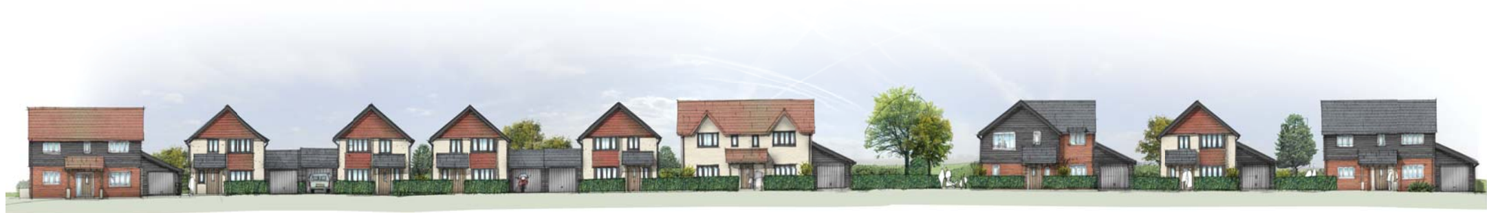
B - B'