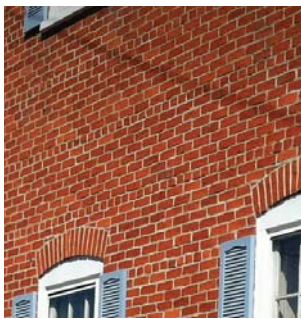
Red Orange Brick